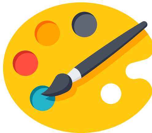
PAINT / WATER COLOURS